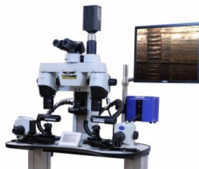
BCM and cartridge case comparison

cartridge cases found at a crime scene to attempt to determine if the source of the toolmarks is the same firearm or multiple firearms.