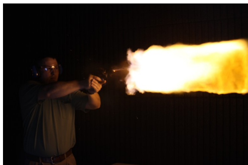
Test firing a 357 Magnum revolver

A function test allows for the examination and documentation of the condition of a received firearm. Things like damage, trace materials, barrel length, trigger pulls, safeties, modifications, and broken/missing parts will be observed, noted, and/or collected. If a problem is found that makes the firearm non-operational, every effort will be made to identify the cause of the problem, and if possible, correct the problem. These tasks are done using a combination of visual and microscopic techniques, using a stereozoom microscope, a variety of tools, and potentially borrowed components from the laboratory's firearm reference collection. A function test concludes with attempting to test fire the firearm in the range. Test firing not only shows the firearm can be made to fire, but also allows for the collection and retention of both bullet and cartridge case exemplars that may be needed for a comparison to scene evidence.