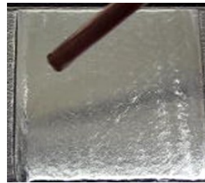
Defaced Serial Number

In an attempt to hide the origins of a firearm, it is not uncommon to encounter firearms with obliterated serial numbers. We have several techniques, both chemical and physical, that can be used to try to restore or recover the lost serial number.