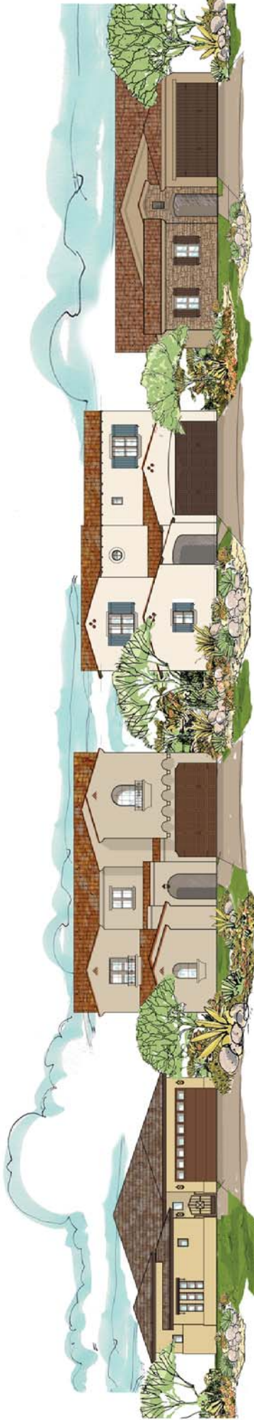
PLAN 1 "A"