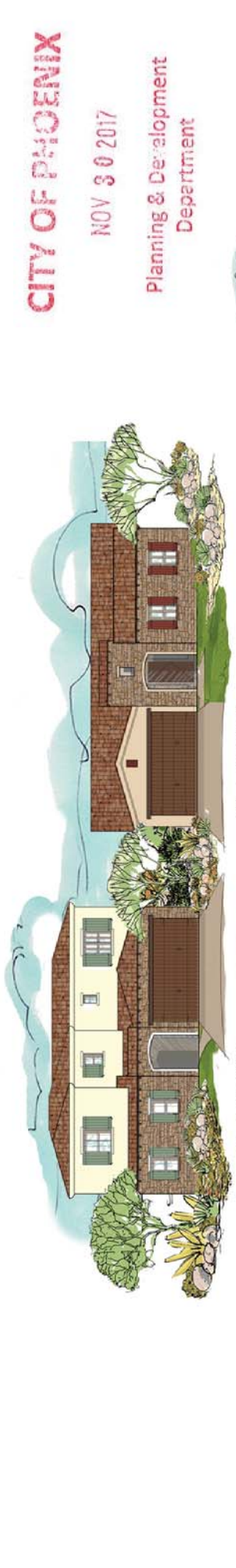
PLAN 5 "B"