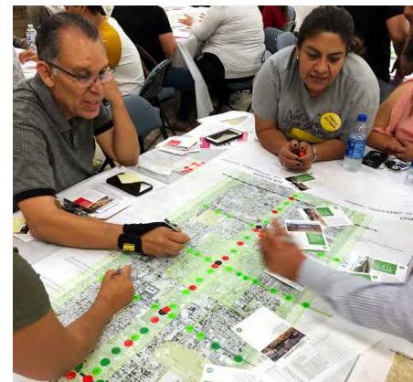
South Central residents engaging in community workshop activity.

The March 9th closeout session reflected information that was collected during the first workshop with continued feedback and discussion from community members imagining a future state of the community in 2045. The event began with a community conversation about planning elements focused on “what is needed?” and “where it is needed?” Community members participated in a table exercise. Each table had a map of a station stop area. Highlighted were nodes labeled as transit, arterial and neighborhood zones, based on their proximity to the proposed light rail stops. Participants were asked to mark locations on the map with potential land use types using pre-marked stickers of amenities that they would like to see within the community. The exercise allowed for participants to identify areas of change and associated scales. Input received contributed to various aspects of the community vision and illustrations represented in the plan.