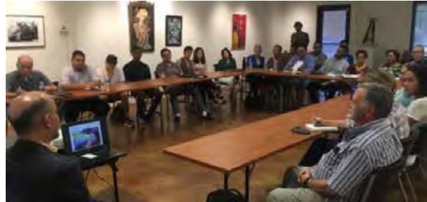
The South Central Collaborative was a pivotal partner in the South Central TOD planning efforts.

The Collaborative consists of more than 40 public, private, nonprofit, philanthropic leaders, and community members. Throughout the planning efforts their group has hosted several partnering meetings, operated four sub-groups, provided recommendation documents on light rail design, presented development guideline recommendations to the South Central TOD Steering Committee, and continues to build capacity between the local community.