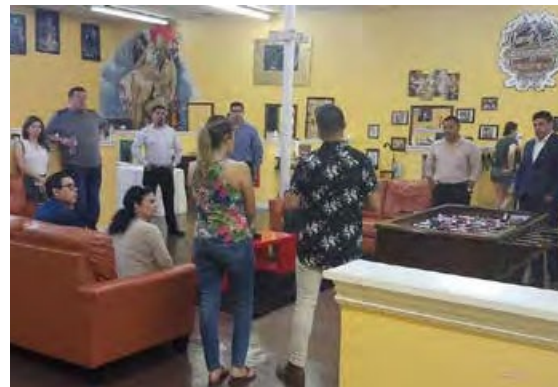
South Central business owners attending December Business Assistance Forum

Business Assistance Forum (December 6, 2018) – The forum brought together business owners from the 19th Avenue corridor to share their stories and experiences of running a business during construction of the light rail extension. The 19th Avenue business owners participated in a panel discussion and then answered questions from audience members that included businesses and residents from the South Central light rail corridor. The topics covered included advice for the best ways to thrive before, during, and after construction.