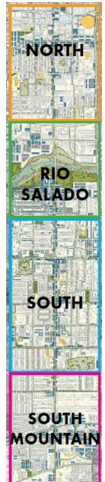
Four Distinct Sub Areas Map

The What We Want section also contains a community-identified “protect, enhance, invest” maps, intended to help guide future development within the planning area. Along with the adopted place types established in the TOD Strategic Policy Framework, these maps will help city staff and the community evaluate future rezoning requests within the four distinct areas of the corridor. The maps depict growth areas as follows: