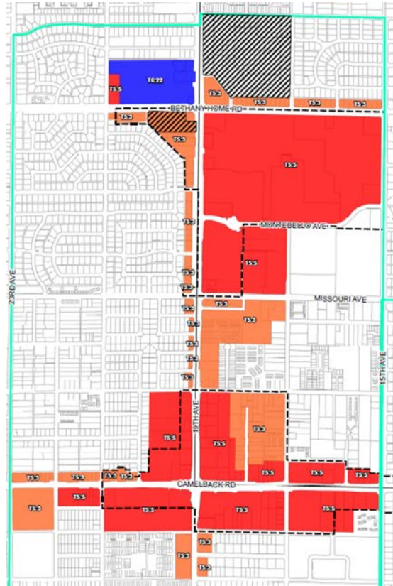
Policy basis for best practice form based code implementation.

District Plan policies are included that support a pedestrian-oriented zoning code, mixed-income neighborhoods, historic preservation, neighborhood compatibility, protection, Complete Streets, green construction, green infrastructure and open space development. The approach for development of the District Policy Plan emphasizes robust community involvement, interdisciplinary collaboration and the use of performance measures to improve accountability and provide a focus on outcomes. Each focus area within the Solano Transit Oriented Development District has Priority Action Plans for